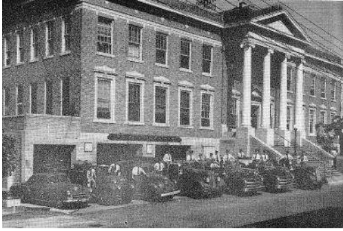
Station No. 1 at City Hall 1953

Current Chief Webster said, "I believe that the new building will enhance the neighborhood. From this facility we hope to be able to build better relationships with the community as a whole and to aid in the revitalization and preservation of the downtown area." The new station may open by December 2009.