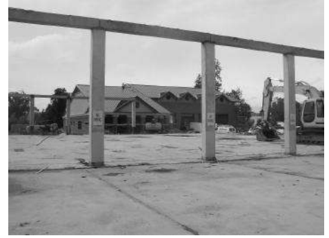
New No. 1 rises behind old bays

Current Chief Webster said, "I believe that the new building will enhance the neighborhood. From this facility we hope to be able to build better relationships with the community as a whole and to aid in the revitalization and preservation of the downtown area." The new station may open by December 2009.