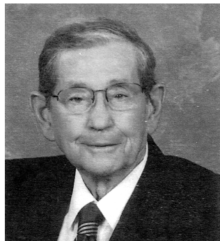
Nov. 11, 1920 – Oct. 18, 2014