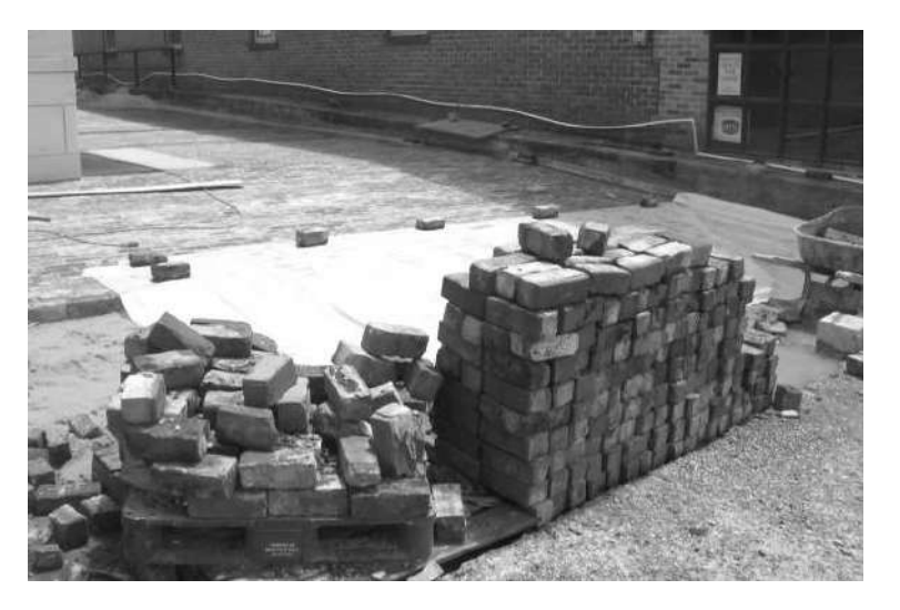
Original brick pavers waiting to be reinstalled