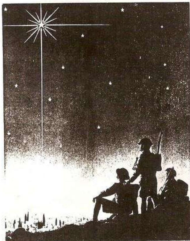
STAR of HOPE

THIS COPY OF A 1942 CHRISTMAS CARD IS APPROPRIATE FOR OUR TIMES TODAY!