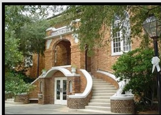
Hattiesburg Cultural Center home of the Hattiesburg Area Historical Society Museum

Information concerning Society newsletters is available by clicking the Newsletter link. The HAHS Newsletter is mailed to all registered members. Please click the Membership link and join our Society.