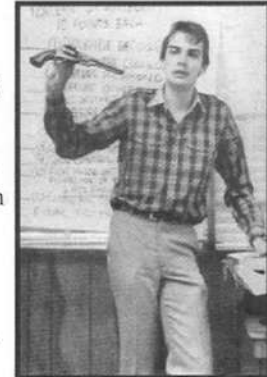
Speaking in history class as a student at HHS