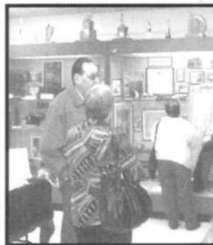
Helping with tours in the HAHS Museum