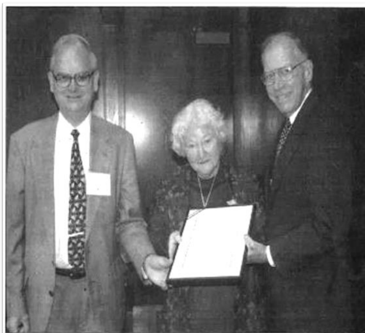
Mississippi Departmentation of Archives and History presented HAHS a Resolution of Commendation for outstanding contributions to the preservation and interpretation of Mississippi history