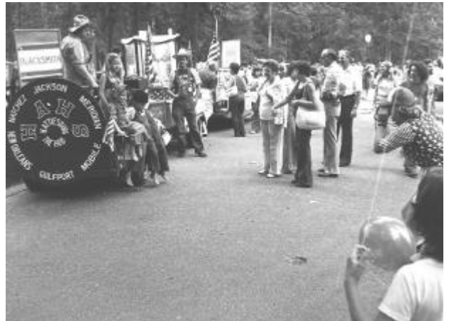
HAHS's float for the bicentennial parade sits at Kamper Park at the end of the parade.