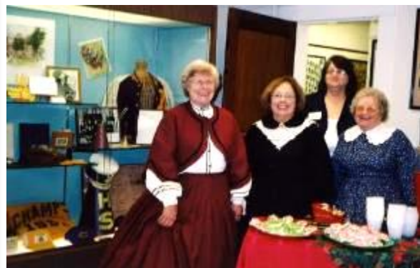
The HAHS held a reception in the museum during The Victorian Candle Lighting. Southern Strings Dulcimers performed traditional Christmas music.