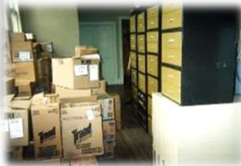
Donations arrive at the Hattiesburg Area Historical Society's work room.