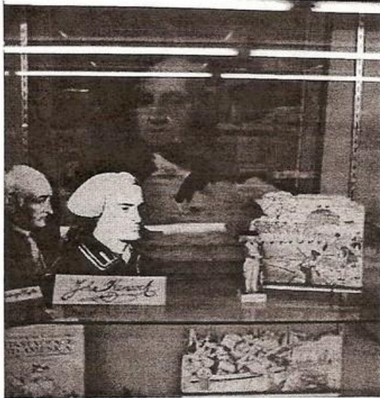
In display cases are "life" size bust figures of Many great Americans