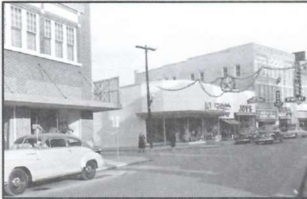
"Merry Christmas Hattiesburg" Main Street buildings at the Batson Street intersection Circa 1950 are left to right: Sears Roebuck and Company, My Shop Ladies Clothing, Joy's Credit Clothing Store, Ben's Clothing, Rollings Jewelry. Above the jewelry store is an Elk head for the Elks Club and Lodge 599 BPOE that were located there.

Today, we want to share some of these with you. Newsletters can also be viewed on our website www.hahsmuseum.org .