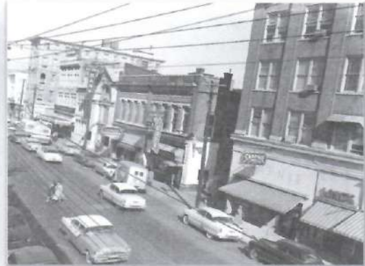
"Rooftop View" Looking at the east side of Main Street from the top of Donavan and Lane's Men's Store on the west side circa 1950 one can see from left: Fine Bros-Matison Co. Department Store, Citizens Bank of Hattiesburg, F W Woolworth Co 5 ¢ and 10 ¢ Store, First National Bank, Eisman's Clothing, K C Cafe and Steak House, Sarphie Jewelry Co., and Lane's Quality Shoes.