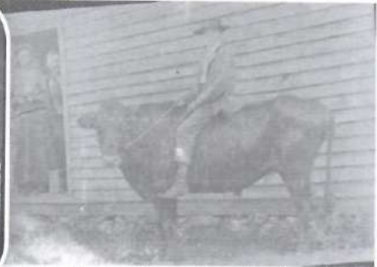
“It’s Not the Purple Cow” and not the Experian Cowboy. We don’t know who this circa 1940 man is or what he’s doing. The man and woman in the doorway seem to be surprised too. If you have this photo and information about it in your family album, please let us know.