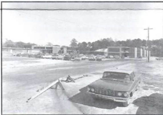
"A New School" Hattiesburg High School on Hutchinson Avenue begins its first year in 1960.