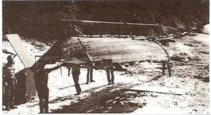
The original raising and moving of the boat. To the left is a photo of the flooring.